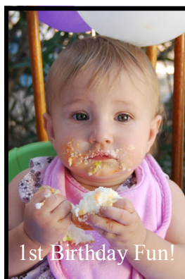
1st Birthday Fun!