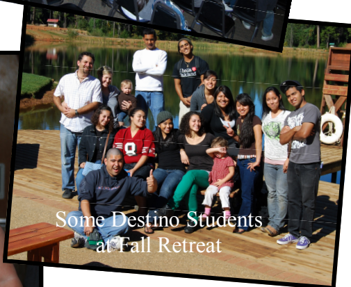
Some Destino Students at Fall Retreat